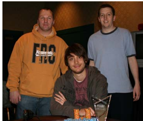
The Top Three!